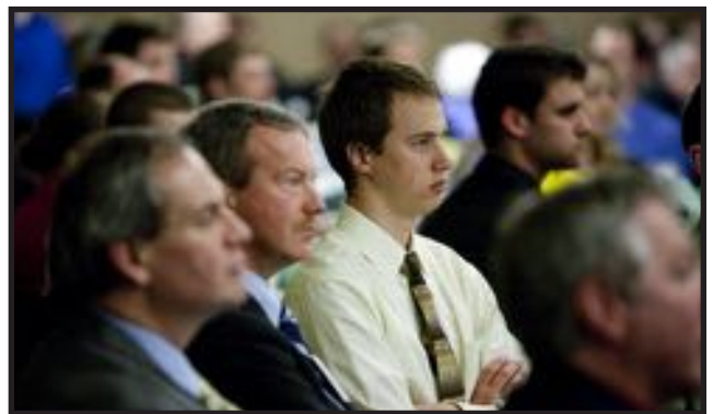
Listening intently during an engineering presentation.