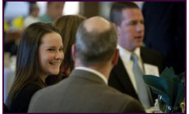
Students networking at the Honors Banquet.