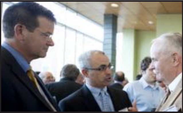
Social Hour networking.