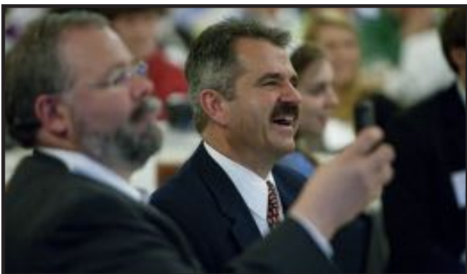
A light moment during the banquet.