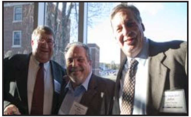
Reconnecting with old friends.