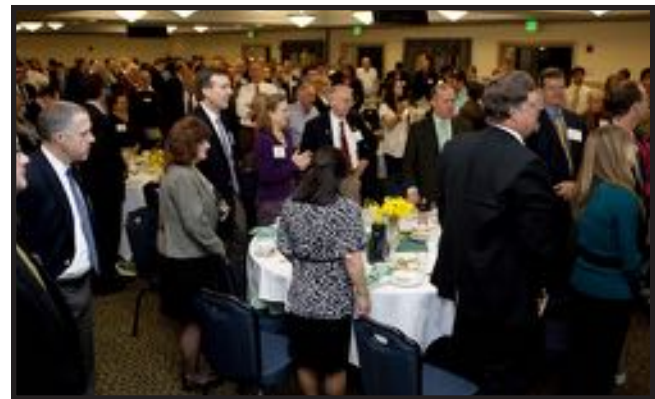
Standing for the Honor Award presentation.