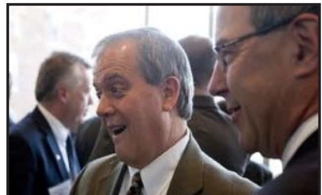
Social Hour discussions.