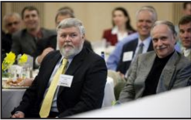
Amused by "Bertie".