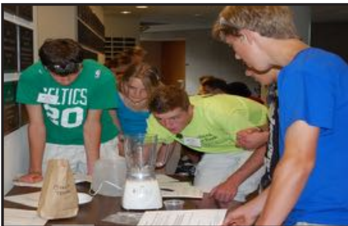
Consider Engineering participants compete to make a piece of paper to meet assigned specifications.