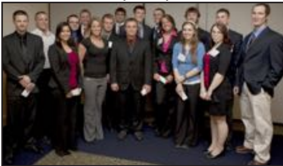
Senior Pulp & Paper Foundation scholarship recipients pose for a picture at the Paper Days banquet.

As has become the tradition, senior scholarship recipients were introduced and called to the stage to receive a congratulatory gift for their accomplishments as PPF scholars and new UMaine graduates. Ninety-five percent of the graduating class of scholarship recipients either have jobs or have elected to go to graduate school.