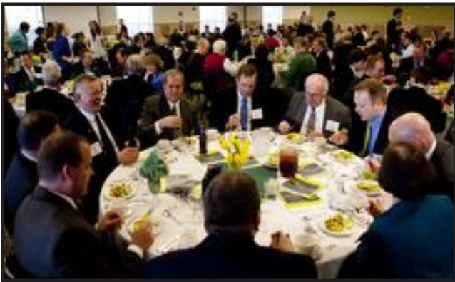
Enjoying good food and friends.