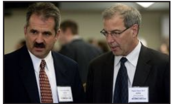
Catching up with friends.