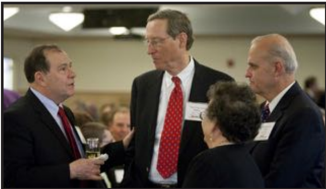
Discussing a new Pulp & Paper Foundation Scholarship.