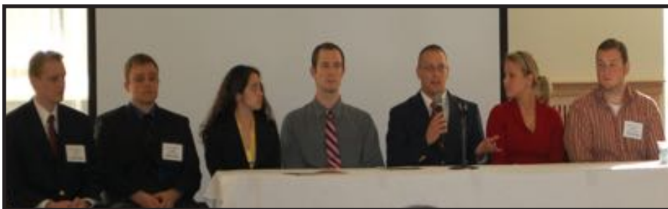
Pulp & Paper Foundation Scholarship Recipients answer questions at the Paper Days Thursday morning breakfast segment titled "How to Attract Top Graduating Engineering Talent to the Paper Industry".