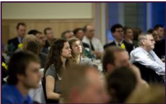
Enthralled with student panel at Breakfast.