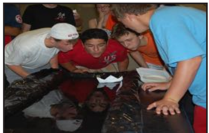
Consider Engineering participants are shown racing boats constructed out of one sheet of paper and one paperclip.