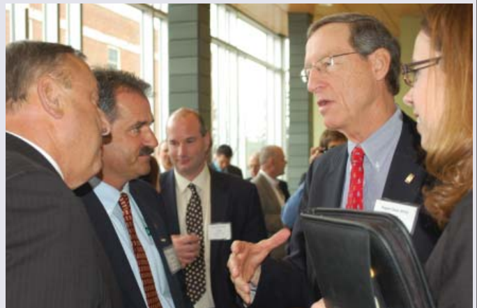
Governor John LePage is introduced to Paper Days guests during the morning coffee break.