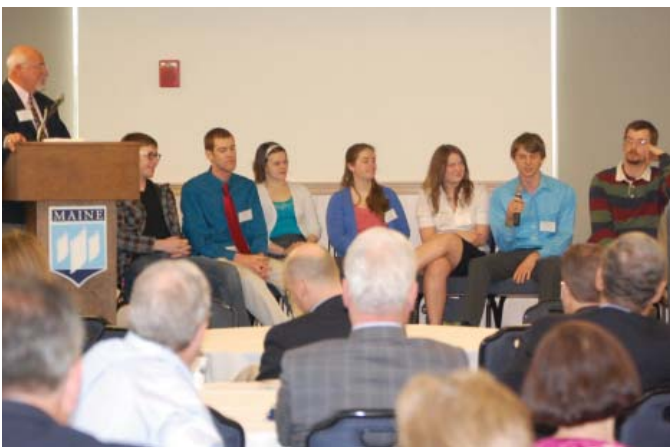
Foundation scholarship recipients participated in a breakfast panel session to discuss "The Paper Industry - A Global Perspective".