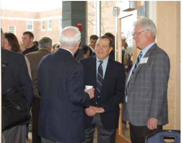
Paper Days social hour is the perfect opportunity to catch up with old friends.