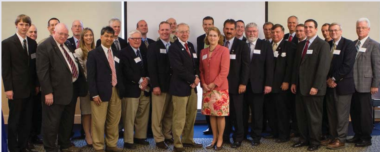
University of Maine Pulp & Paper Foundation Executive Committee and Board of Directors pose for a picture at Paper Days 2012.

Copies of the Foundation's 2012 Annual Report are available from the Foundation office on request.