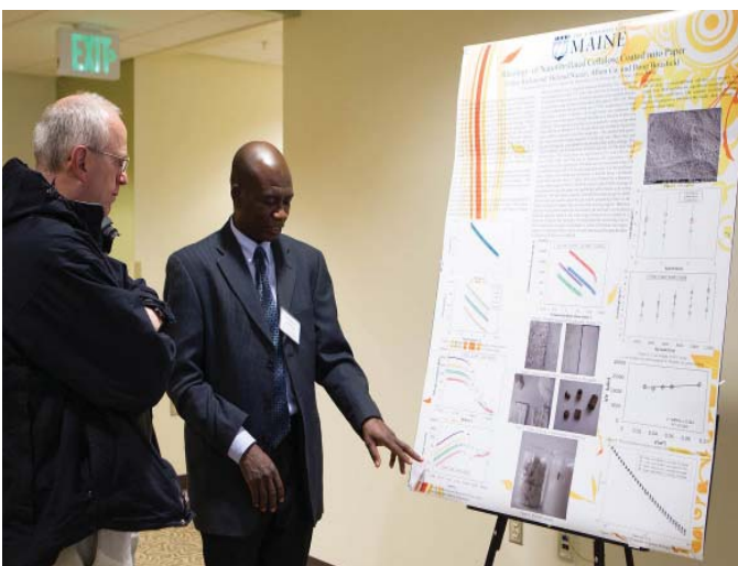
Chemical Engineering graduate students held a poster display showcasing their current research projects at Paper Days.

Speaker presentations and additional pictures are featured on the Foundation's website at: