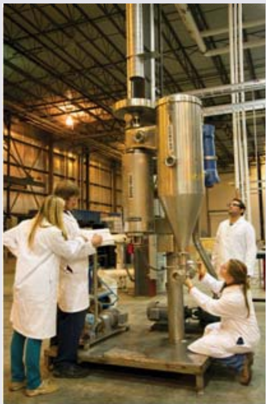
Equipment set-up at UMaine's FBRI Technology Research Center in Old Town, ME.

Companies on the verge of sending cutting-edge, forest bioproducts-based technologies into the marketplace will have new commercialization testing and demonstration capabilities when the University of Maine's Technology Research Center (TRC) opens this summer at 880 Main St., in Old Town, Maine. A grand opening will be held on June 18. TRC, a component of the University of Maine's Forest Bioproducts Research Institute (FBRI), is located on the grounds of Old Town Fuel & Fiber, a pulp mill purchased in 2008 by private equity firm Patriarch Partners.