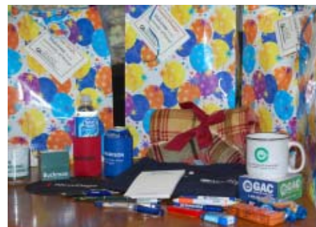
First-year scholarship recipient's "welcome" gift bags distributed at their fall banquet.

After dinner, students were presented with "welcome" gift bags filled with useful dorm and desk trinkets. Foundation company members supplied gifts sporting corporate logos as a reminder to the students of their future employment possibilities.