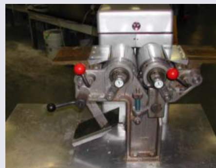
Pictured (top photo) is the laboratory sheet splitter (bottom photo) is the TechPap MorFi Fiber Analyzer.