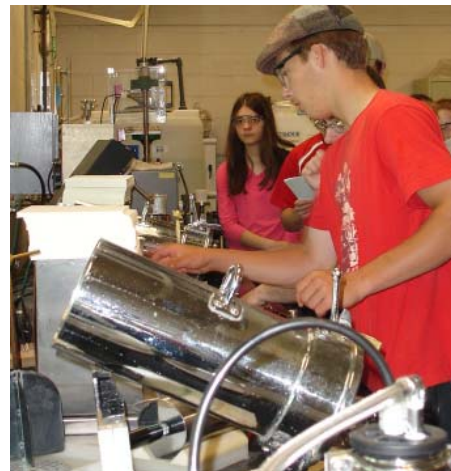
Students made and tested handsheets at the 2007 “Consider Engineering” summer program.